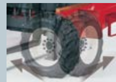
4-WAY DESIGN LETS YOU MOVE LONG LOADS THROUGH TIGHT SPACES.