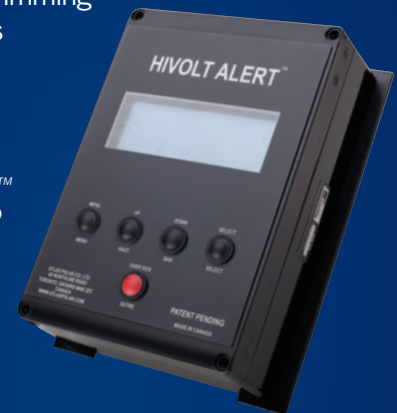
HiVolt Alert™ Display Hub