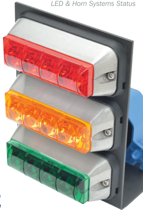
LED & Horn Systems Status

The HiVolt Alert™ systems are early warning systems. Operators must still be aware of and cautious when operating around live power lines.